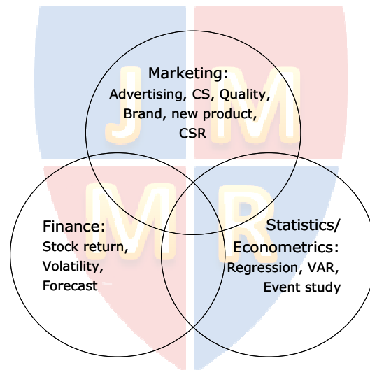
Figure 1. Marketing-Finance Interface Components